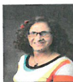
RUBY THOMAS SPENCER SCHOOLS